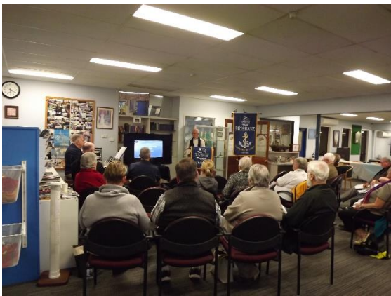
Sea Sunday at the seafarers centre

https://www.mtsbrisbane.org.au/sea-sunday/