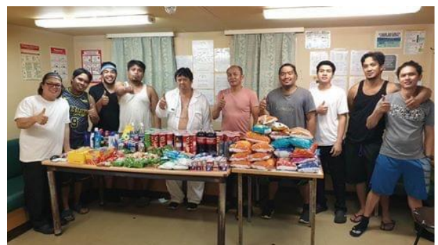
Some incredibly happy seafarers on MT Blue Sea

MT “Blue Sea” is still at anchor off Mooloolaba awaiting the “green light” to proceed in for a much needed crew change and discharge of the cargo.