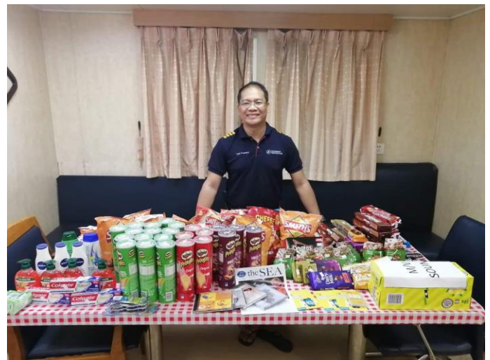
Captain of MV Sounni