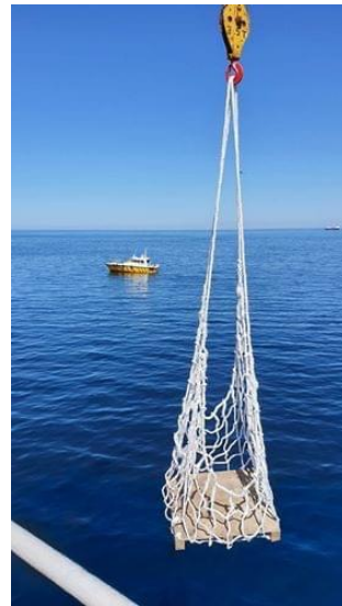
Loading “care Packages” thanks to Brisbane Pilots

It didn’t take long for us to let the seafarers aboard “Blue Sea” know that there was an online shop and a small team of staff at the seafarers’ centre that wanted to help. With some great coordination across our Facebook page and a lifeline offered to us by Brisbane Marine Pilots and their pilot launch, we managed to deliver to the vessel at anchor off the coast of Mooloolaba. A massive thank you to the Pilot launch team and Brisbane Marine Pilots.