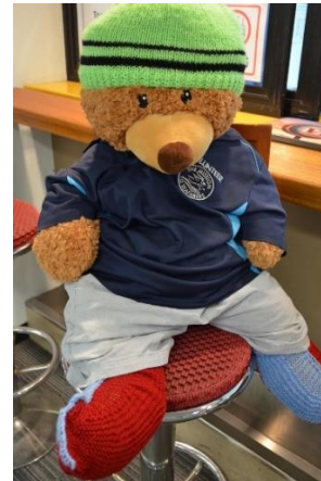
Vinnie the Volunteer

Vinnie the bear has become the honorary seafarers' friend at the Brisbane Seafarers Centre. While Vinnie is not quite old enough (yet...) to be able to join as a crew member, he spends his days actively engaging with those seafarers that have the pleasure of visiting our seafarers centre. To keep in touch over this period of isolation, Vinnie has started his own Facebook page to keep his many seafaring friends connected with what has been happening at the Mission. If you have time to keep abreast of the travels of Vinnie and friends, follow him on Facebook at Vinnie the Volunteer Mission to Seafarers Brisbane